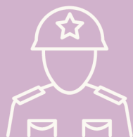
Back to Basics Bootcamps: ACH & Check

We advocate for our members through partnerships with groups like HAFISO and by supporting events such as World Elder Abuse Awareness Day.