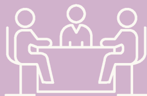
Annual Members' Meeting